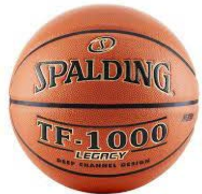
Spalding TF-1000: The official ball of the MBCA and the MIAA Tournament